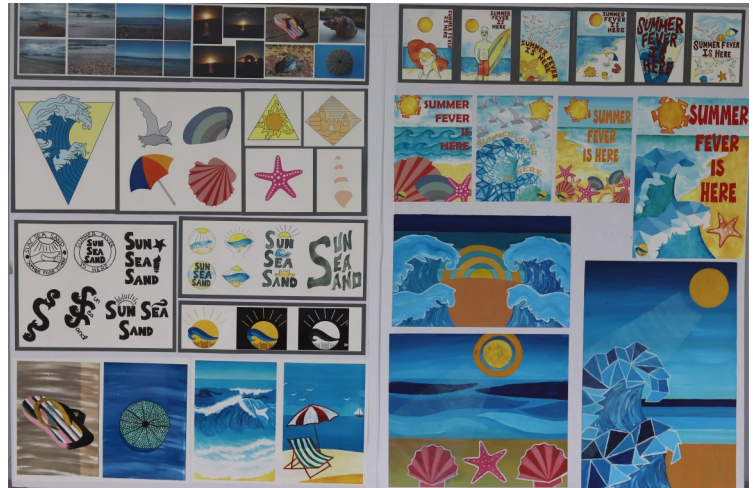
(Above) By Kitchie Turque