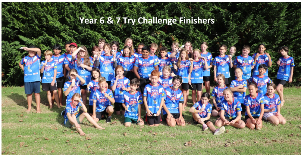
Year 6 & 7 Try Challenge Finishers