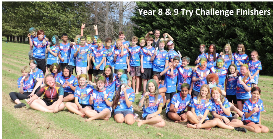
Year 8 & 9 Try Challenge Finishers

Today we held the Year 6-9 Try Challenge. The course started with the strength and fitness section of skipping and pushups in the gym before progressing to the obstacle course which included army style cargo net, hay bale climb, ski ramp jump, egg and spoon and a cross country run to finish. The event ended with medals and iceblocks.