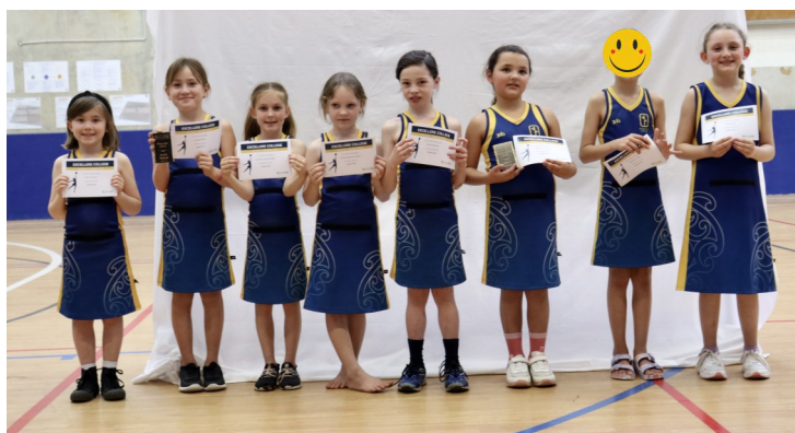
Stars - Year 3&4