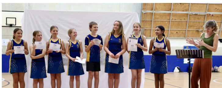
Blue Ravens - Year 7&8