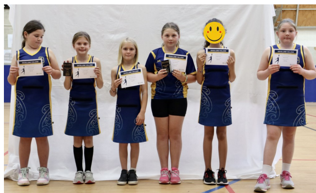
Roxy Foxes - Year 5&6