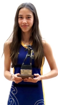
Senior Player of the Year