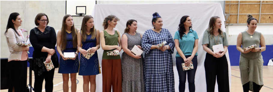
2023 Netball Coaches