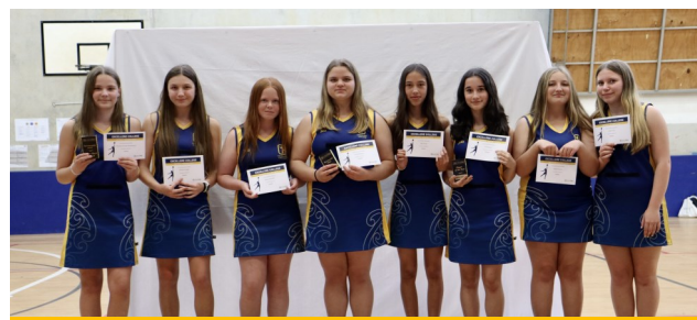
Hotshots - Year 9+