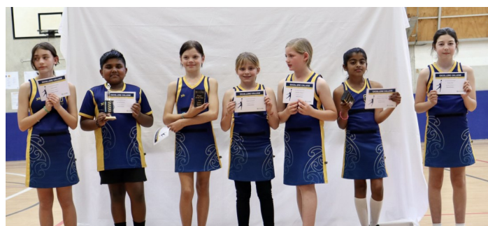
Flamingos - Year 5&6