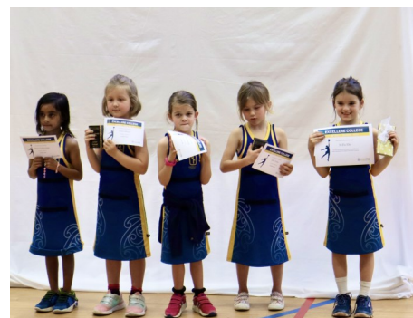
Year 1&2 Cubs