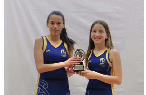
Int. Players of the Year