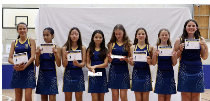
Ferns - Year 7&8