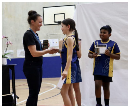
Year 5/6 Player of the Year