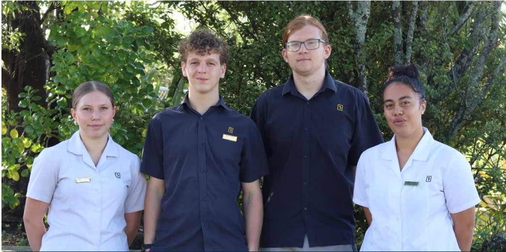
2026 Head Prefects